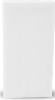
NV-099 ULTRA WHITE ICEBERG