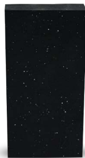
NV-402 SPARKLE BLACK