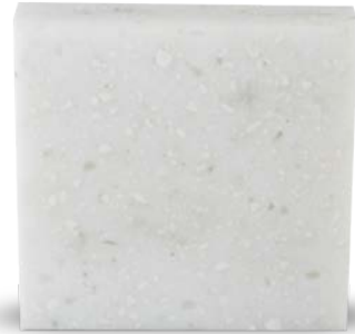
NV-305 SNOW WHITE