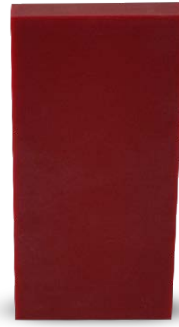
NV-104 RUBY RED