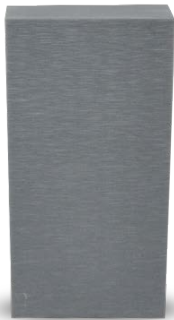
NV-118 NAVY GREY