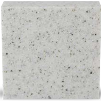
NV-304 MINERAL GRAY