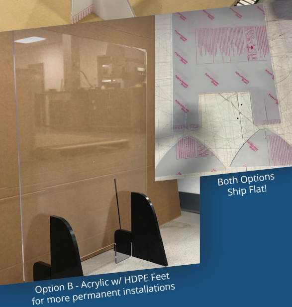
Both Options Ship Flat!