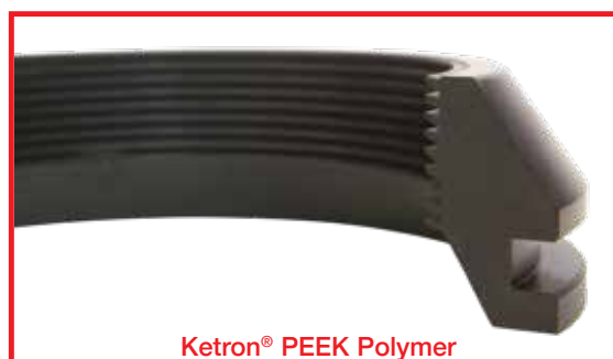
Ketron® PEEK Polymer Labyrinth Seals