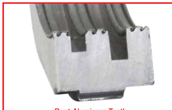
Bent Aluminum Teeth