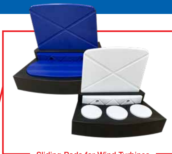
Sliding Pads for Wind Turbines